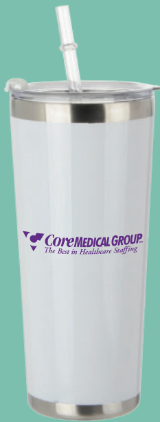
BTL116 20 oz STRAW BOTTLE