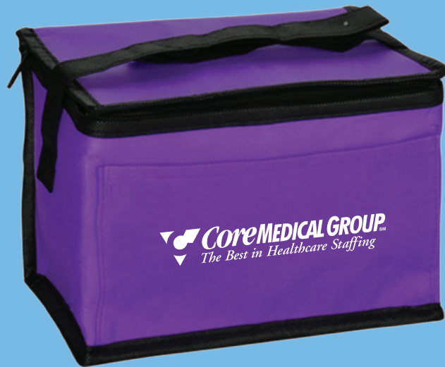
BAG300 8" W x 6" H x 5.5" D 6 PACK COOLER