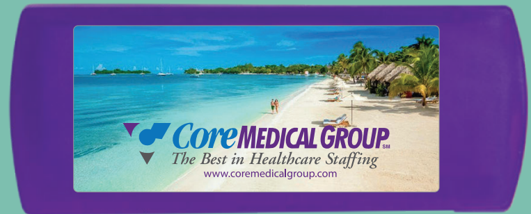
BD101 BANDAGE DISPENSER