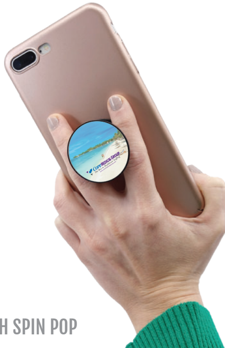
PC-POP100 POST CARD WITH SPIN POP