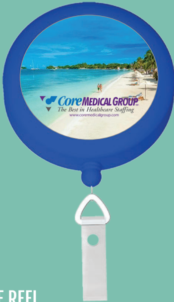
BR100 ROUND BADGE REEL