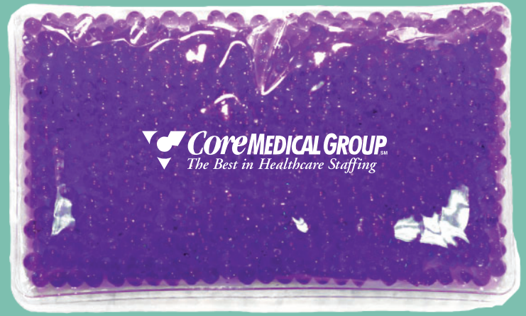
HCP100 GEL TEKBEADS HOT/COLD PACK