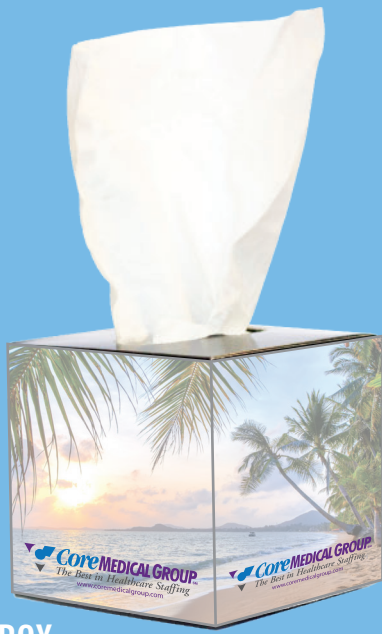
TIS300 MINI TISSUE BOX