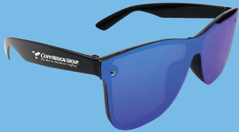
SG325 REFLECTIVE RIMLESS SUNGLASSES