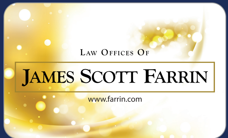
MPC101 4-IN-1 RECTANGLE MICROFIBER MOUSEPAD CLEANING CLOTH