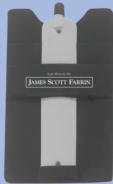
TW400 SILICONE SMART WALLET WITH STYLUS STAND