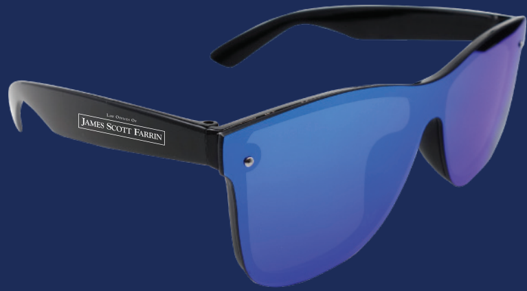
SG325 REFLECTIVE RIMLESS SUNGLASSES