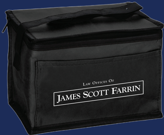
BAG300 8" W x 6" H x 5.5" D 6 PACK COOLER