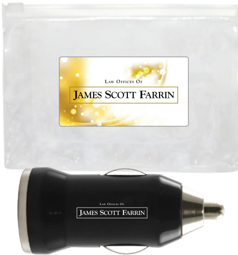
KIT106 TEK BOOKLET WITH MICROFIBER CLOTH + PVC POUCH