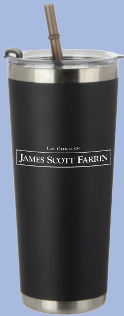
BTL116 20 oz STRAW BOTTLE