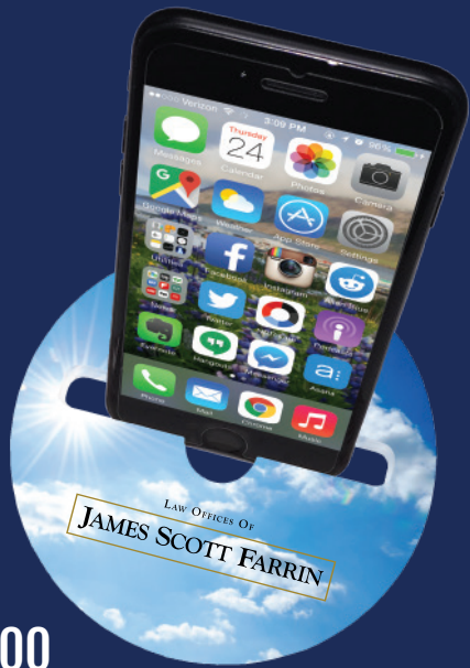
ACR-PS100 ACRYLIC PHONE STAND