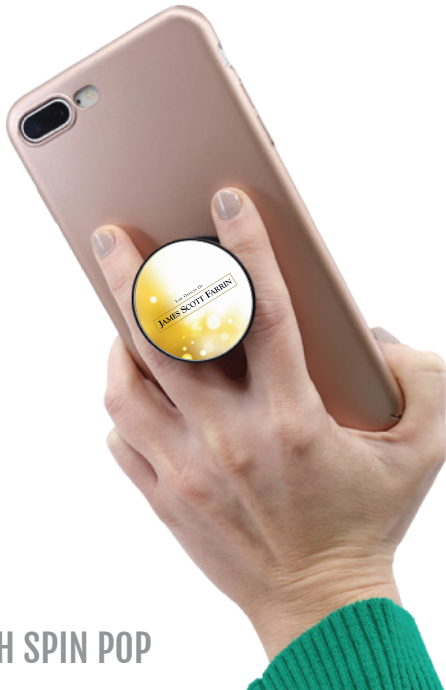
PC-POP100 POST CARD WITH SPIN POP