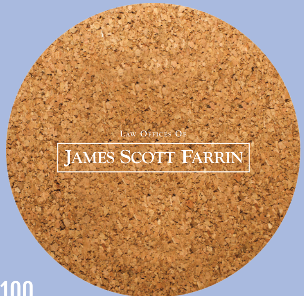
PCC100 ROUND CORK COASTER