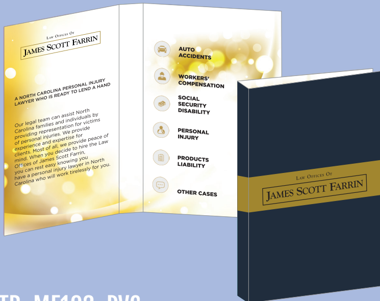
TB-MF102-PVC TEK BOOKLET WITH MICROFIBER CLOTH + PVC POUCH